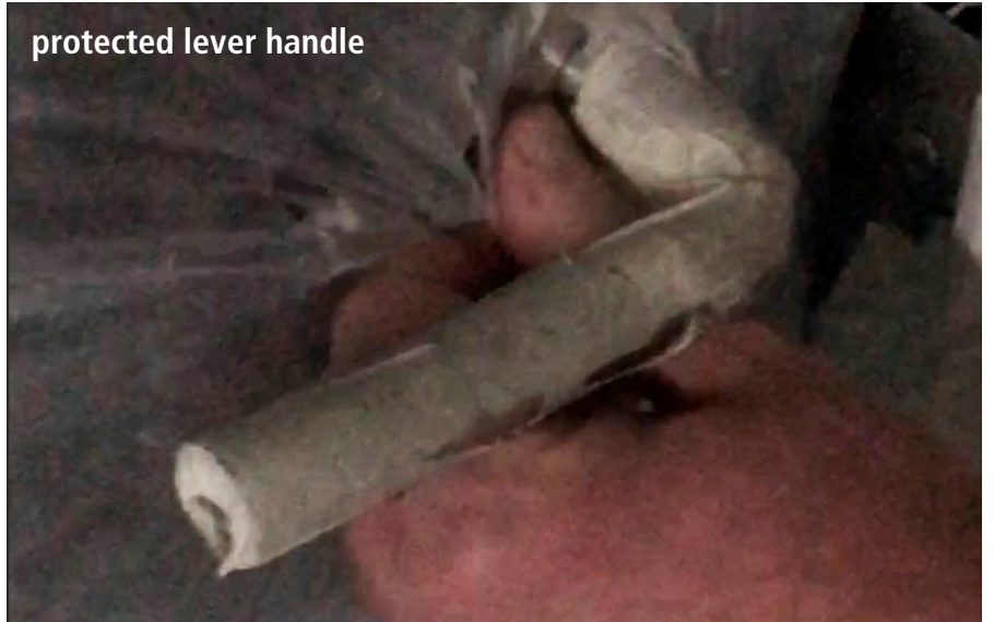
protected lever handle

Trim and decorative hardware such as lever handles, pull handles, panic hardware and push plates should be covered with the required protection during the remaining construction phase. This will ensure that the finish does not become damaged and the operation of the product is not compromised. If these covers are not installed site debris can become lodged inside the unit impairing performance and there is potential for metal surfaces to become contaminated with foreign particles (particularly from adhesives and paint), which can result in the deterioration of the substrate finish.