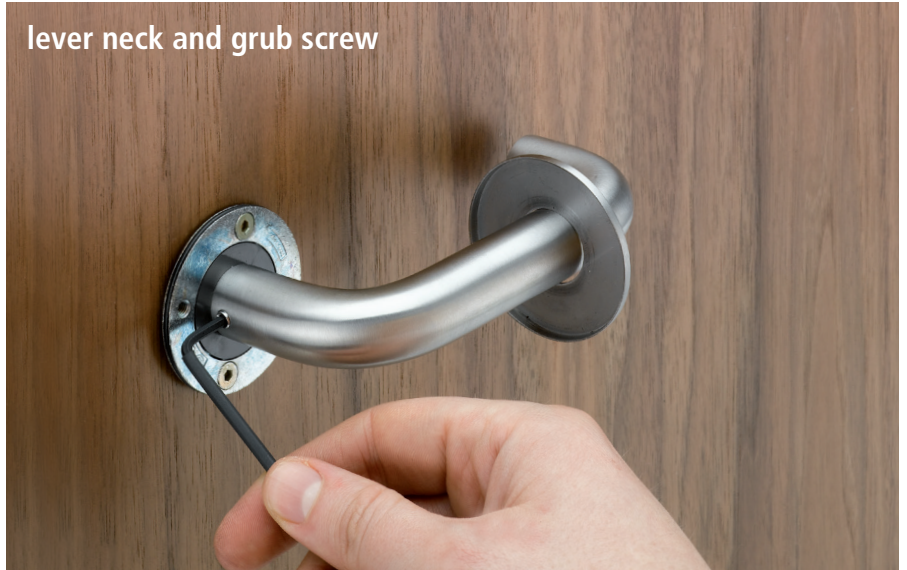
lever neck and grub screw

Prior to hand over the products should have their protection removed and all fixings should be readjusted to ensure that they are fitted as per the fixing instructions provided. All products should be cleaned, as per their respective instructions or as detailed within the "O&M Manual – Care of Finishes" section), and any site damage rectified. Lever handles and pull handles should be checked that all bolt through fixings and grub screws are tightened and installed correctly.